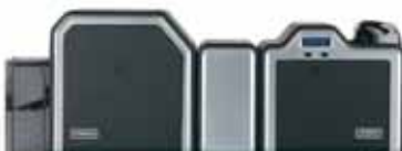
Lamination option and dual-sided printer/encoder

Modular design grows with your needs. Not sure what your ID card applications will require in the future? No problem. The HDP5000 is easily upgraded to fit your needs. Start with a basic single-sided unit. Install encoding modules. Upgrade to dual-sided printing. Add lamination, or simultaneous dual-sided lamination for the ultimate in card security and durability.